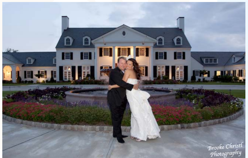
Pine Lakes Country Club