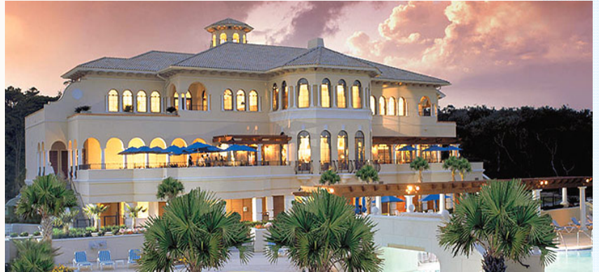
Ocean Club at Grande Dunes