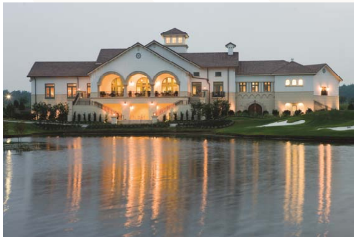
Members Club at Grande Dunes